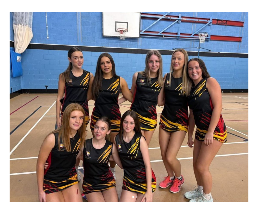
Our year 9 & 11 girls produced some great performances versus Ysgol Bro Dur. Excellent games were played with huge talent on show for Neath Port Talbot!

It has been a feast of Netball this week with our year 10 and 7 netball teams competing against Ysgol Cwm Tawe on Tuesday. The year 10's gave a brilliant performance whilst year 7's strength in depth meant that some of the girls were playing their first match against a strong Cwmtawe team.